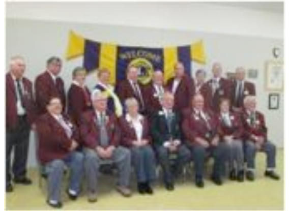
2013 2014 A-5 Cabinet

The theme for 2013-2014 is "Follow your Dream". Nearly every great Accomplishment began as a wildly ambitious dream whether it was landing a man on the moon, running a four-minute mile or webbing together the entire world through computers.